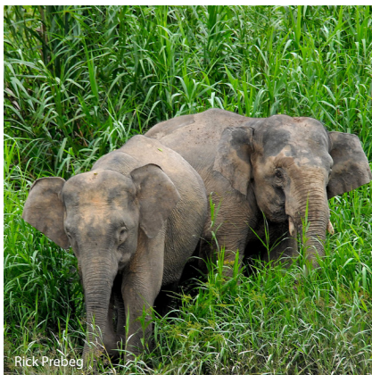
Borneo elephants are among the many species threatened by habitat loss in Sabah.

The New York Times named this part of Borneo as one of its top places to see in 2020, and our travel package will be a unique and intimate way to experience this unforgettable destination. We hope you'll join us.