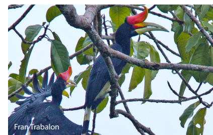
Hornbills and other large birds inhabit the dense jungles of Malaysian Borneo and play a key role in the health of the ecosystem.