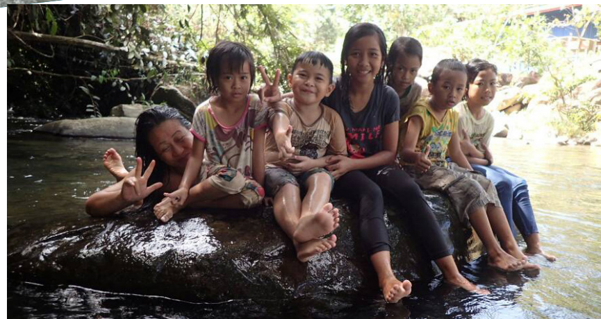
Many rivers and streams crisscross Borneo, providing fresh water, fish, and with Seacology's help, sustainable electric power to the island's remote communities.

“Every year, thousands of acres of pristine rainforest are burned down to make way for new palm oil plantations, but tourism could provide an incentive to protect these primeval jungles. Perched in the northeast corner of Borneo, and with multiple airports, the Malaysian state of Sabah offers diverse experiences while still being largely off the tourist map.”