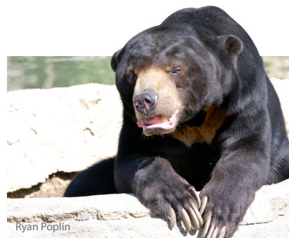
The world's smallest bear species, sun bears can be found throughout Borneo. Our group will visit a sun bear sanctuary near Sandakan.

—“52 Places To Go In 2020,” The New York Times