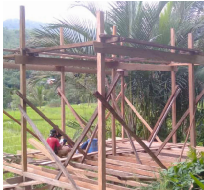
Swiftlet hut under construction

Bird's nest soup is a delicacy in east Asia. Its namesake key ingredient is the abandoned nest of a species of swiftlet abundant in Borneo. The birds usually nest in caves, and people have collected their nests for many years. But the birds will also nest in structures built just for them. With a Seacology grant, the community is building a swiftlet hut, a small, dark building where the birds can nest and raise their young. After the babies fledge, community members will collect the nests and sell them—for a good profit—on the international market. This will bring much-needed income to the village.