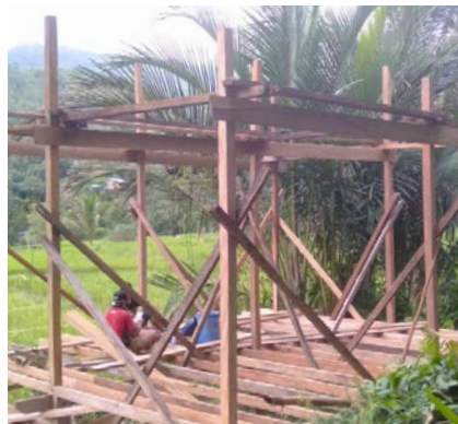
Swiftlet hut under construction

With a Seacology grant, the community is building a swiftlet hut, a small, dark building where the birds can nest and raise their young. After the babies fledge, community members will collect the nests and sell them—for a good profit—on the international market. This will bring much-needed income to the village.