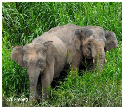
Borneo elephants are among the many species threatened by habitat loss in Sabah.

The New York Times recently named this part of Borneo as one of its top places to see in 2020, and our travel package will be a unique and intimate way to experience this unforgettable destination. We hope you'll join us.