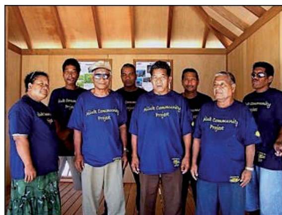
Figure 2. Ailuk Ook Fishery Committee.

gressive in its thinking, and dedicated to sustainable development, further projects were undertaken and including the establishment of a community fisheries committee, a group comprising representatives from local government and all major groups within the community, including traditional leaders, women’s groups, fishermen, people from the main populated islands, and youth groups. The group is called the Ailuk Ook Fisheries Committee (OFC, Fig. 2).