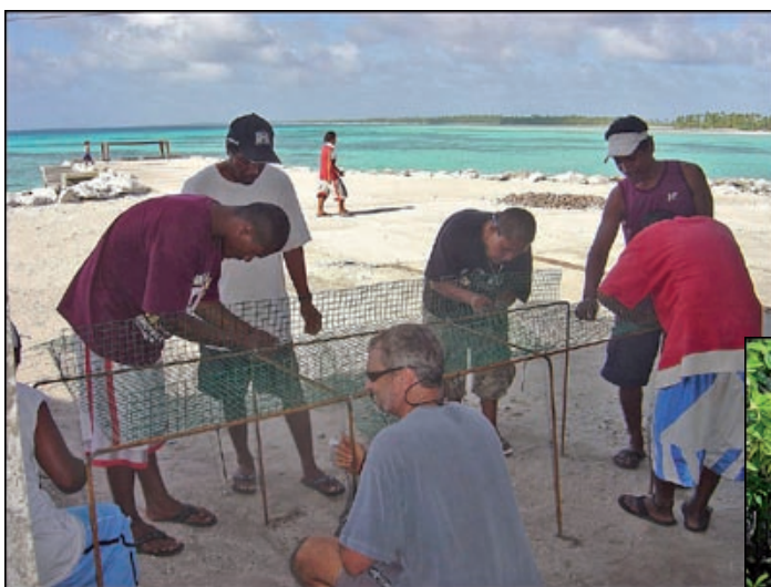
Figure 3. Trainees working on setting up a coral farming pilot experiment.

The above initiatives — which included the conservation, management, and identification of no-take zones, identification of alternative sources of livelihoods, education and awareness, general capac-