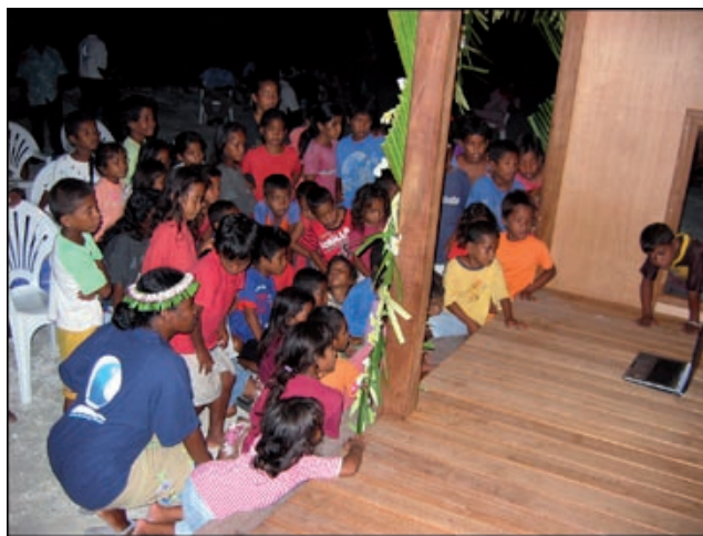
Figure 7. Ailuk school children watching underwater pictures on the newly donated community laptop computer.