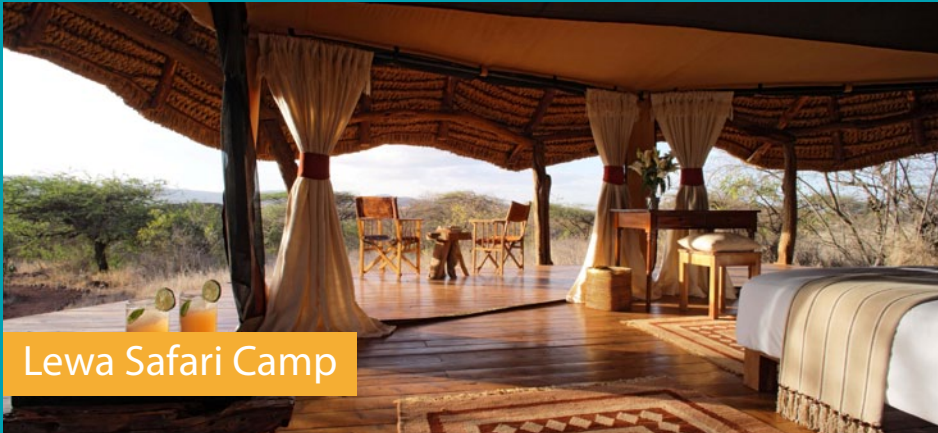
Lewa Safari Camp

The award-winning Lewa Safari Camp has a stunning location, with outstanding game viewing, and spectacular views to Mt. Kenya to the south and arid lowlands to the north. Each tent has a thatched roof, verandah, and full en suite bathroom, very much in the 'Lewa' style. The central areas have exquisite gardens with a large sunny verandah and swimming pool to enjoy during the day and cozy log fires in the lounge and dining room for the more chilly evenings.