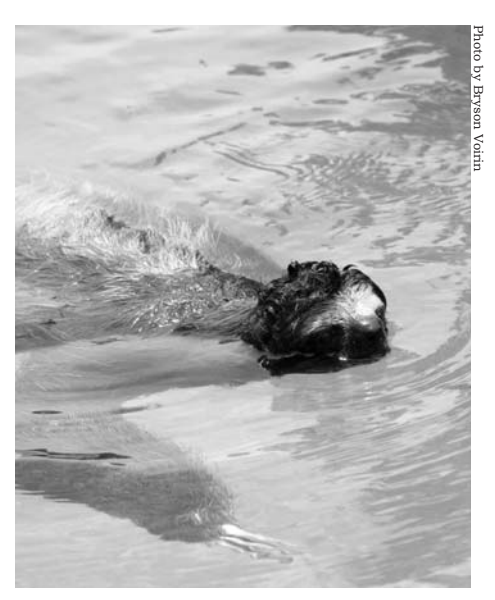
Sloths are slow in trees but are decent swimmers, like this pygmy sloth.

ing stoves are a much healthier option for them as well, cutting down on exposure to carbon monoxide when cooking indoors. Seacology's strength remains its sensitivity to indigenous cultures as well as the species and habitats in their charge. With your help, we are finding solutions to some of the most difficult challenges our planet faces. Hopefully, the pygmy three-toed sloth will be a success story for all going forward. •