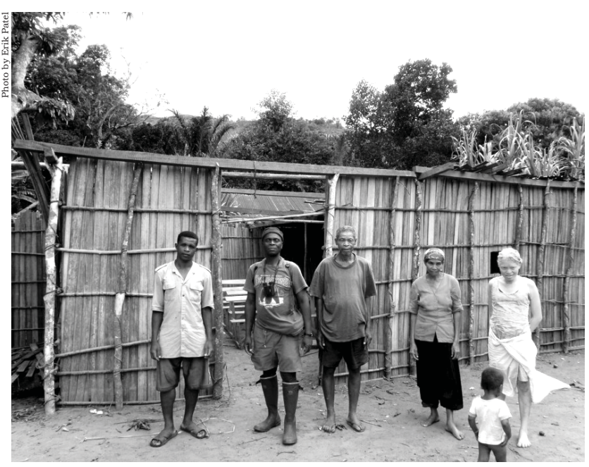
This dilapidated schoolhouse in Madagascar's Antsahaberaoka village will be replaced with three new primary school classrooms equipped with furnishings and a restroom block.

TONGA - Refurbishment of an existing community hall and its facilities, including a new bathroom, water tank, gutters and furnishings in exchange for support of 531 acres of Fish Habitat Reserves for a minimum of 10 years—Ovaka Village, Vava'u Group.