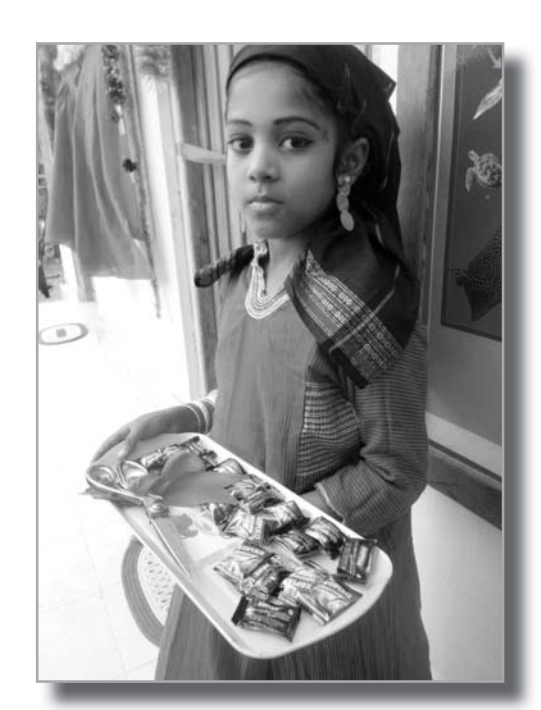
ABOVE: A girl holds the scissors for the ceremonial ribbon-cutting.