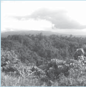
Kawangkoan, Indonesia rainforest.