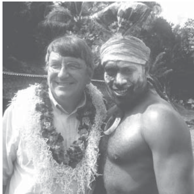
Dr. Paul Cox with a Nakalavu, Fiji villager.

Seacology is driven by a single purpose: to protect indigenous cultures and habitats on islands throughout the world. The model we use to accomplish this mission – building schools, clinics, community centers and other needed improvements in return for conservation covenants protecting precious rain forests, coral reefs and other island habitats - has been spectacularly successful. Over 100 projects have now been completed in island communities in 40 countries throughout the world.