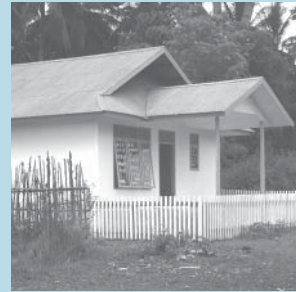
Seram Island, Indonesia medical clinic.