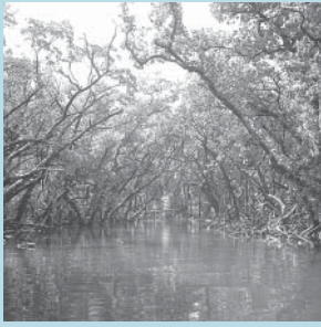
Kanif-Magaf Mangrove Channel, Yap, Micronesia.