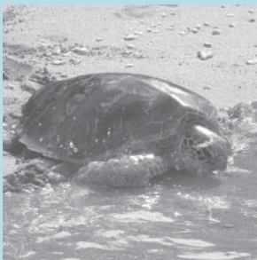
Sea turtle at the Nguna-Pele Marine Reserve, Vanuatu.