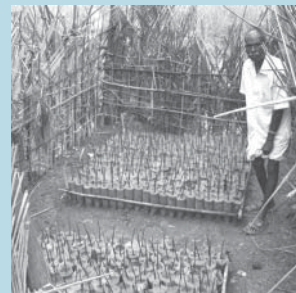
Mangrove seedlings, Andaman Islands.