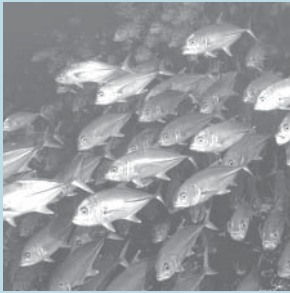
School of jacks, Marovo Lagoon, Solomon Islands.