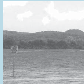
A Locally Managed Marine Area, Papua New Guinea.