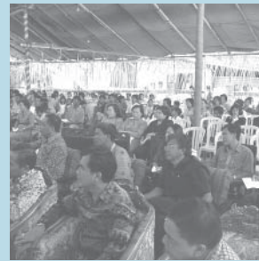
Opening of the Kumu, Indonesia school.