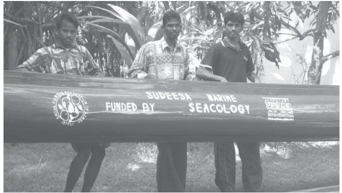
Local fishermen with a Seacology-funded fiberglass fishing canoe, Kiralakele Village, Sri Lanka.

To aid the villages beyond repairing the damaged projects, in typical Seacology fashion, on-the-ground representatives were contacted and asked to determine what local residents affected by the tsunami wanted to help reconstruct their lives and livelihoods. In the Andaman Islands, villagers received chickens, goats and sewing machines for an alternative