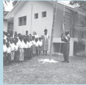
Children at the opening of the Espiritu Santo, Vanuatu community center.

*Support for asterisked projects is generously provided by the Nu Skin Enterprises Force for Good Foundation.