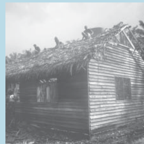
Re-roofing marine NGO offices, Papua New Guinea.