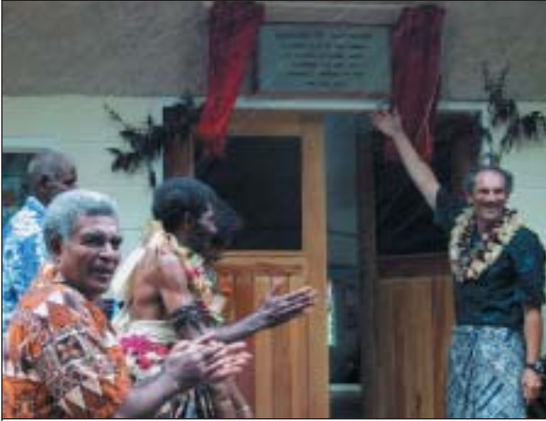
At the opening dedication

DS: In our brief four-year history as a staffed organization we have launched 65 projects, all of which lead to immediate tangible results. We have a counter on the homepage of our website ( www.seacology.org ) which indicates that to date we have preserved 38,310 acres of island terrestrial habitat and 804,475 acres of coral reef and other marine habitat. These figures are precise and we can document every one of these acres.