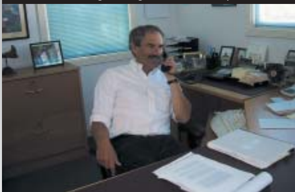
Hard at work generating revenue for a worthy cause

FM: Enough about you, tell us about Seacology.